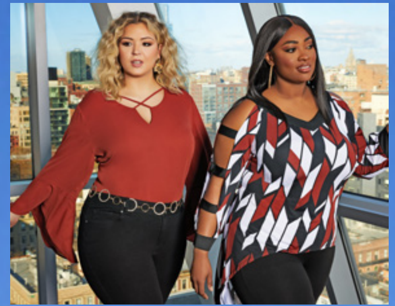
// FROM THE TOP