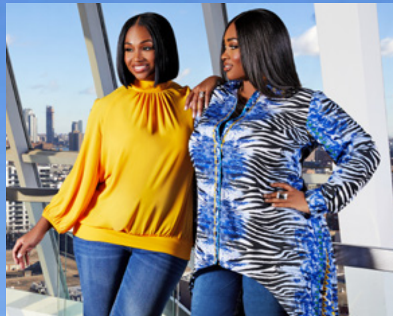
// ELEVATE YOUR JEANS