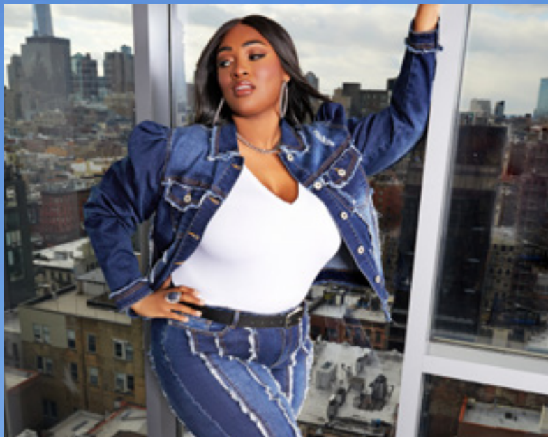
// DENIM UPGRADE